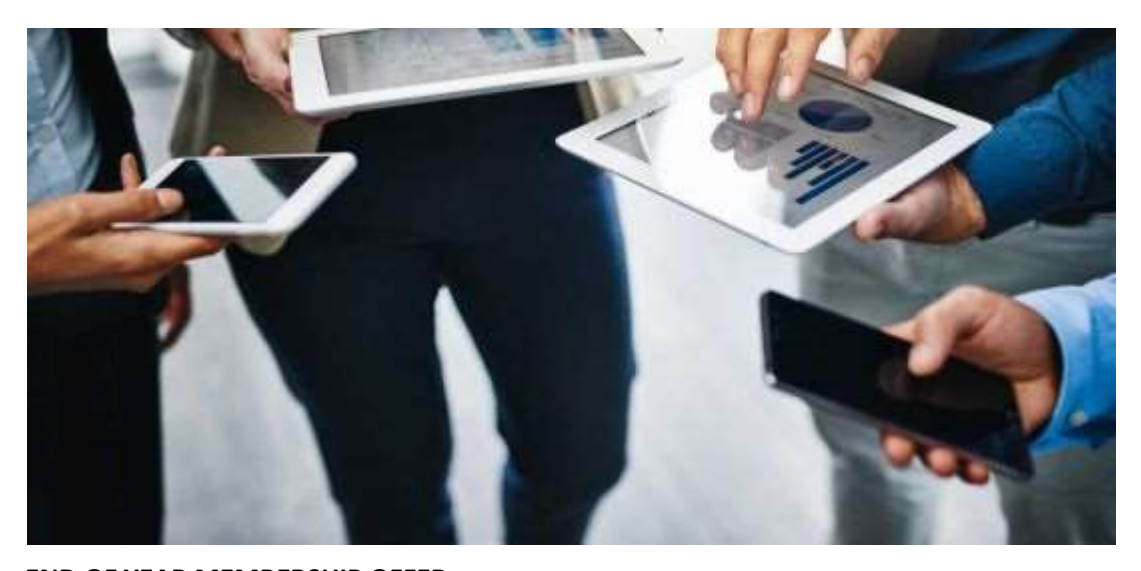
END OF YEAR MEMBERSHIP OFFER BCC SECRETARIAT, 15 SEPTEMBER, 2021

Special offer for new members! Any new member joining the British Chamber now will have the remainder of 2021 free and will only be invoiced for 2022 annual membership.