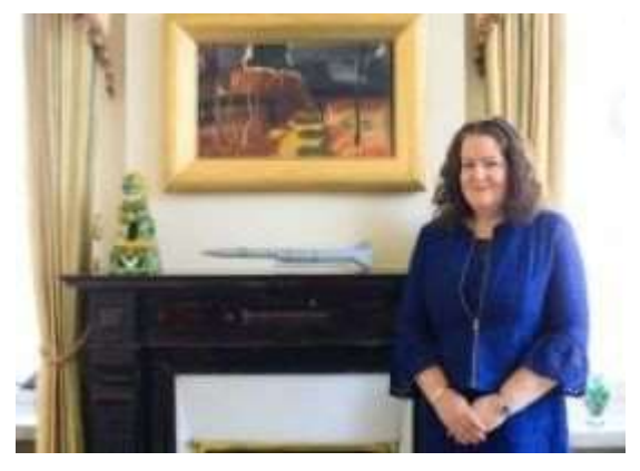
BCC SUSTAINING MEMBERS' BRIEFING 21/10/2021 08:00